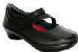
Paris - Black HW011W-03