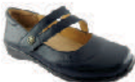
Gardenia - Navy HW006W-02