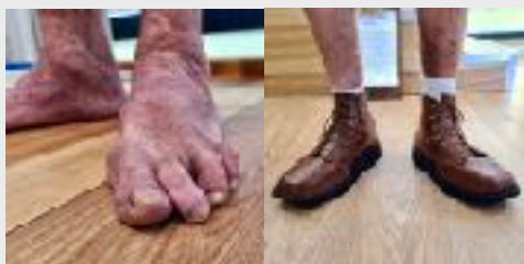
by Paul Shim

The aim of the treatment plan was to deliver boots which can accommodate the shape of his feet. Also, to offload the high-pressure points on the plantar aspects due to the posterior tibial dysfunction and hammer toes. Last but not least it was important to have the boots aesthetically pleasing for the patient to ensure good compliance.