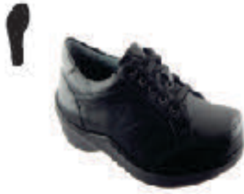
Porto - Black HW002WA-09