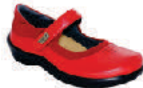
Istanbul - Red HW002WA-05