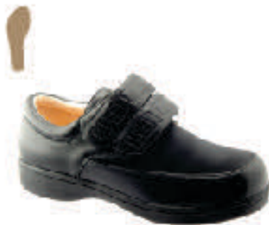
Diabetic Shoe - Black HW027W-01

Diabetic Shoe Size 38 - 46 Available in Standard & Extra depth Plastazote Lining & Removable foot bed