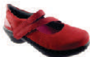
Paris - Red Lizard HW011W-03