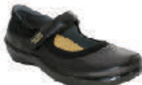
Istanbul - Black HW002WA-05