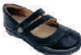
Gardenia - Black HW006W-02