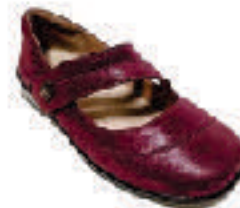
Gardenia - Burgundy HW006W-02