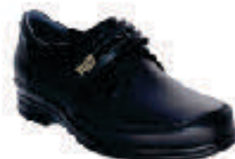
Albany - Black HW007W-01