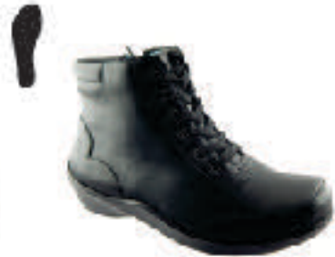
Marlo - Black HW002H-01