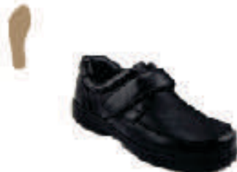
Jim - Mens Single Velcro Stretch HW027W-03