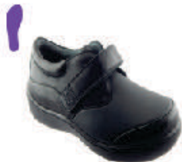
Denmark - Black HW002W-07

Diabetic Shoe Size 38 - 46 Available in Standard & Extra depth Plastazote Lining & Removable foot bed