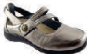
Bali - Pewter HW006W-09