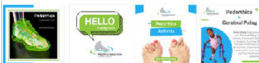
Upcoming PAA campaign posts

Be sure to follow PAA on social media, like and share our posts and use hashtags such as #paa #pedorthics #pedothist and #pedorthicsaus when posting yourself.