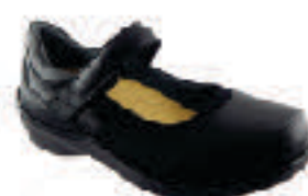
Spain - Black HW002WA-08