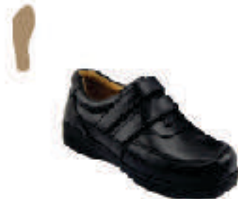
Jack - Mens 2 Velcro HW027W-02