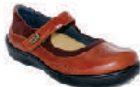
Istanbul - Tan HW002WA-05