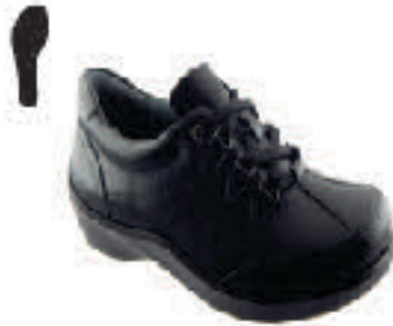
All Walker - Black HW002WA-07