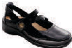
Bali - Black HW006W-09