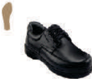
John - Mens Lace HW027W-03